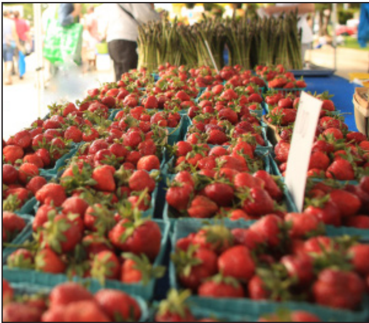
The Farmers' Market is held from 7 a.m. to 1 p.m. Saturdays from May 20 to Oct. 28 at 460 Lake St.