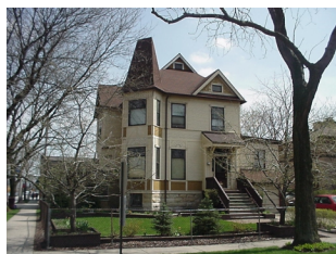
102 S. Grove