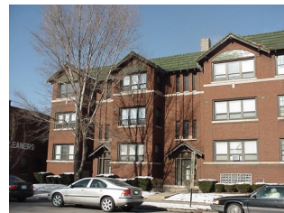
255-257 South Maple