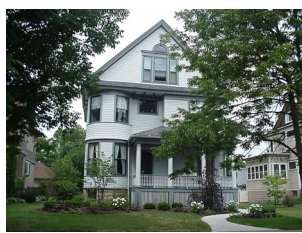
235 S. Grove