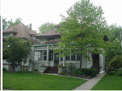
213 S. Elmwood