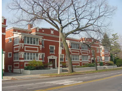
135-141 N. Ridgeland