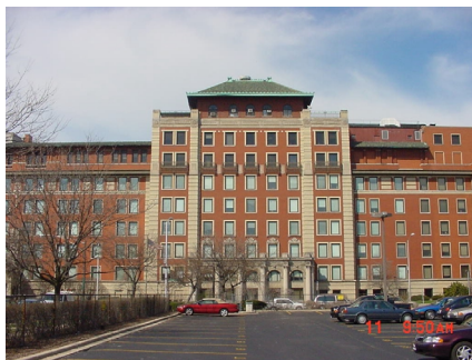
West Suburban Hospital