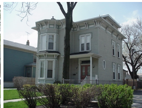
121 S. Maple