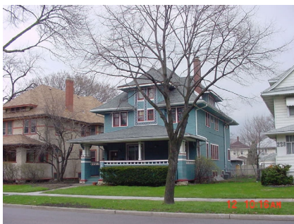
224 S. Ridgeland

In 1907, when A. D. Orvis built all twelve houses on the east side of South Ridgeland Avenue, including several stucco residences, he had Roberts design the house at 224 South Ridgeland; Roberts probably designed the other houses on the block. Each of the houses have a somewhat distinct character but blend together well suggesting an harmonious community of homes when contrasted to a block of insistent individual Queen Anne houses. The introduction of modern stucco residential architecture and its striking continuity from one house to the next gave the District's streetscapes a new unity. In 1914, the builder W. E. Palmer constructed five adjacent detached stucco houses at 202-214 Pleasant Street. Varying only the attic dormer permitted the houses to blend together without the striking distinctions of the Victorian block. After 1900, the atmosphere of suburban sanctuary and retreat from the city, apparent in the individual Victorian home, expanded into the street. In 1916, discussing R. G. Hancock's building of entire blocks of uniform California bungalows, both inside and outside of the Historic District (1914, east side of 300 block on North Taylor) the Oak Leaves reported, "The general style of the building lends an air of refinement and exclusiveness not possible where the types of building vary greatly and no defined building restrictions are followed." 3