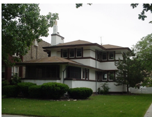
418 S. Harvey