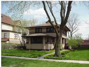
106 S. Grove