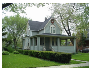
418 N. Cuyler