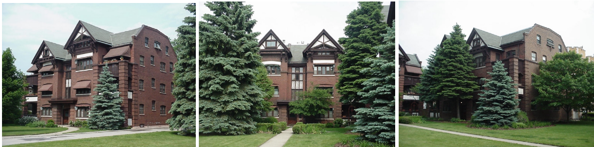
108-118 S. East Avenue – “Quadrangle” Apartments

The building ordinance did not completely ban larger apartment buildings; however, the general air of resistance to flats did affect their design. In 1905, discussing the “ Impending Calamity ” the Oak Leaves expressed the hope that the apartment building controversy and regulation would either put an end to their development or lead to “ such a modification of the flat idea as to bring it into harmony with...Oak park ideals; ” according to the newspaper E. E. Roberts’ design for Luther Conant’s “ Quadrangle ” apartments (1905, 108-110 South East) represented one such building “ in harmony ” with those ideals. 10 Roberts, who advertised himself as an architect of “ Homelike Homes ” and “ homey dwellings ” led the way in extending “ homey ” images to the Oak Park apartment building. In the “ Quadrangle ” development, Roberts placed three separate buildings with six apartments each, around a well-kept lawn and circular driveway. The building observed the building line established by private residences on the block. Roberts excluded light courts and airshafts entirely – every room had an outside window. The half-timbered gable, the open porches for each apartment, the broad lawn, shared more common features with suburban private residences than with the flat-roofed “ dry goods boxes ” of the typical urban flat buildings. The Oak Leaves applauded the design as a “ high water mark of apartment house construction. ” 11