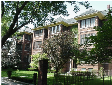
The Glen Ellyn