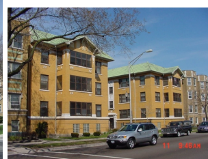
Midway Park Apts.