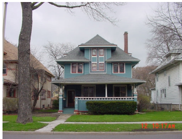
224 S. Ridgeland