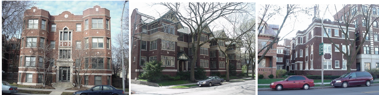
Apartment buildings in the Historic District.

constituted a second generation of building on their sites. Larger apartment buildings with several separate entrances arranged along or around landscaped courtyards developed between about 1915 and 1929. The 1920s buildings continued to incorporate contemporary stylistic elements from domestic architecture. Thus, while the detached residences do not reflect the general return to stylistic revivalism, the District’s apartment houses of the 1920s contain surface ornaments characteristic of Tudor, Medieval, and Classical architecture.