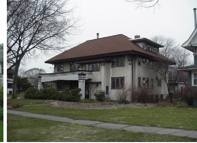
241 S. Elmwood

In 1910, pointing to the stringency of the building ordinance the Oak Leaves reported that ordinance had encouraged the construction of two-flats; it noted with some satisfaction that they had “ the exterior appearance of an ordinary dwelling, and (were) proving a very desirable thing as a place of residence, as an ornament to the community, and as an investment. ” 9 These stucco two-flats succeeded in disguising their multi-family character by following the same basic site plan and building outline as the single-family house and obscuring or tucking away the second entry.