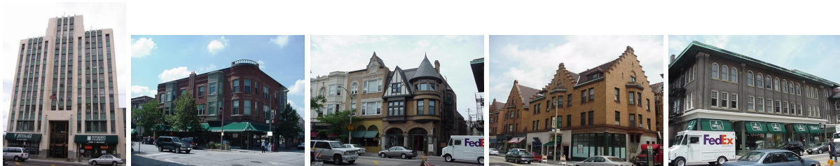
Medical Arts Niles Building Cicero Gas Scoville Block Second Scoville