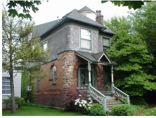
130 S. Kenilworth