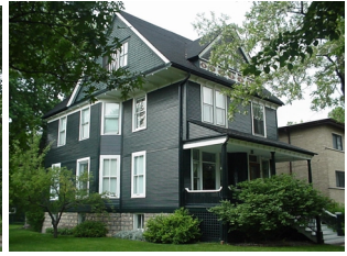
113 S. Elmwood