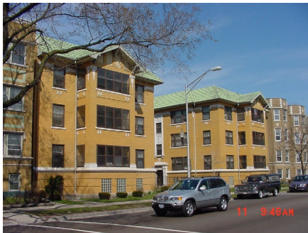
Midway Gardens, 440 N. Austin