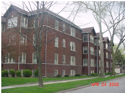
Biggs Brothers Apartment

Although the apartment buildings built between 1905 and 1920 in the District rarely achieved the site and architectural character of the “Quadrangle,” this building included what turned out to be many recurring elements and themes. Most importantly, obvious efforts were made to harmonize the features and concerns of contemporary domestic architecture with apartment building design. The interchange was spurred by the controversy and regulations concerning the apartment in Oak Park. To varying degrees, the apartment designs left an unaccustomed amount of lawn around the building, exceeding the 15% to 25% required by ordinance. In 1916, the building ordinance was amended to require that apartment buildings observe the building of adjacent buildings on the block; however, some apartments had already observed this requirement – for example, H. H. Richards’ design for the Biggs Brothers Apartment (1910-15, 201-207 S. Lombard) and the “Glen Ellyn” (1912, 127-33 S. Harvey). The “Oakdale Apartments” (1906-07, 136 S. Harvey) did not observe the lot-line and did not evidence particularly imaginative design; yet, its narrow width in relation to the lot eliminated the need for courts and air shafts and left an ample 100-foot wide backyard. A 1907 advertisement for the “Oakdale” declared that it was designed on the premise that “the dweller in an apartment is entitled to the same conveniences and to as good light as the man who lives in a house.” 12