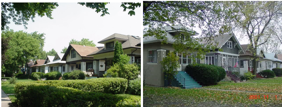
300 block of North Taylor Avenue

The modern residential buildings in the District tended to preserve the 2 and 2-1/2 story plan of earlier residences; yet, it did, in some cases, accommodate different building forms. Promoted primarily by the Oak Park builder R. G. Hancock, some modest 1-1/2 story, stucco, California-style bungalows (such as those along the 300 block of North Taylor Avenue built in 1913) did appear in the District. They represented an extreme in the simplifying tendencies of modern design. More importantly, maintaining the same over-all exterior form of the modern stucco single-family residence, the two-flat, double decker, detached residence appeared in the District after 1900. Cleverly designed and disguised as a single-family home, the two-flat apartment settled harmoniously and, in many cases, unnoticed into blocks of single-family residences. The detached single-family and two-family houses generally occupy the center of rectangular lots with 50-foot street frontages and depths of from 150 feet to 175 feet.