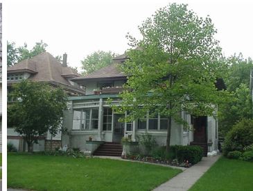
213 S. Elmwood

The "Quadrangle" apartments (1905, 108-110 South East) and the "Wisconsin" apartments (1906, 309-315 Wisconsin), both designed by Roberts, are two of the District's nicer apartment buildings. Roberts also designed major civic, religious and commercial buildings in the District; these include the Municipal Building (1903-04, s.e. corner Euclid and Lake Street), the Scoville Business Block (1905, s.w. corner Lake Street and Oak Park Avenue), the West Suburban Hospital (1911-12), the Playhouse Theater (1913, 1111 South Boulevard) and the Euclid Avenue Methodist Episcopal Church (1921-22, s.w. corner South Euclid Avenue and Washington Boulevard). These and other non-residential buildings harmoniously supported and complemented the District's pervasive residential character.