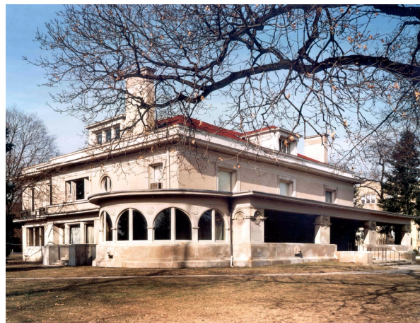
217 Home, "John Farson House"

George W. Maher's John Farson House (1897-99, 217 Home), constructed in the nineteenth century, anticipated and suggested the reorientation of the District's domestic architectural style, which came in the first two decades of the twentieth century. The Farson House is the District's largest, most costly, residence. It occupies substantial grounds made possible by Farson's purchase and removal of eight adjacent houses. The flat walls of Roman brick, the crisp geometry of the windows, bordered in stone, the simple rectangular openings of the porch, the low roof, the symmetry, formality, and classical atmosphere of repose in the main façade was antithetical to the neighborhood's Queen Anne exuberance. The District's subsequent detached residences, both grand and modest, increasingly embodied the simple elements of quiet repose found in Maher's design. Projecting bays, dormers, corner turret towers, porches, were compressed, restrained or eliminated leaving a stripped down, rectangular, box-shaped "minimal," house.