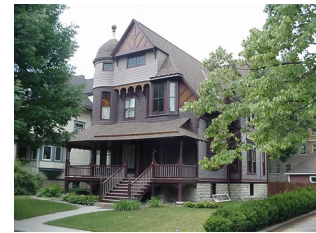
209 S. Grove