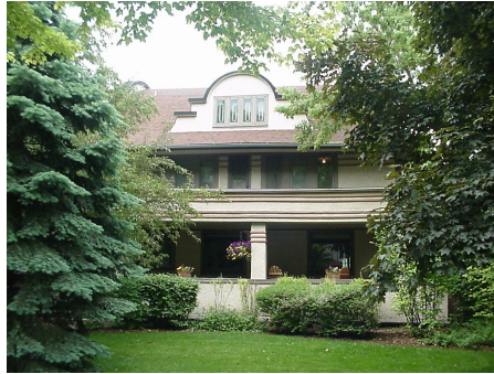
324 S. Euclid

curved gable and dormer above a more formal base is one of Roberts' most notable stucco houses.