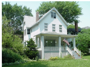
143 N. Harvey

Some of the District’s oldest remaining houses dating from the 1870s and 1880s are Gothic cottages and Italianate houses whose builders and architects are unknown; these include, for example, Gothic cottages located at 139 and 143 North Harvey Avenue and 143, 144, 418 and 419 N. Cuyler Avenue and Italianate style houses at 121 South Maple and 211 Clinton Avenue.