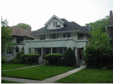
211 S. Elmwood