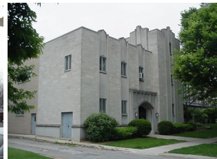
Euclid Avenue M.E.