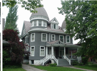
330 S. Euclid