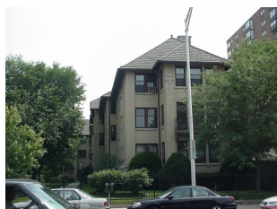
The Oak Ridge

Other notable apartment designs include two buildings by architect Willam B. Pruyn, Jr., the “Oak Ridge” (1916, 949 Lake) and the “Lorain” (1915, 38-44 Washington). The Johnson Brothers firm of builders constructed some of the fine apartment buildings in the District, including two large courtyard buildings – “Midway Park” apartments (1915, 440 North Austin) and “Ridgecourt” (1915, 302-312 Washington). “Homey” apartment buildings like “Seven Elms” with half-timber, stucco, tile roof, and landscaped courtyards (1915, 815-821 Lake) could harmoniously settle into the “architectural center of Oak Park,” around the Scoville Institute, an area which it had earlier been thought would be spoiled if apartments were constructed. 13