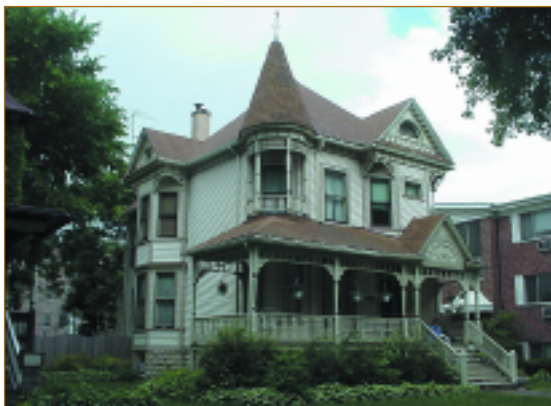
329 Wisconsin Ave.

The Ridgeland-Oak Park Historic District was listed in the National Register of Historic Places in 1983 and was locally designated by the Village of Oak Park in 1994. The District has irregular boundaries, but is generally bounded by Austin Boulevard on the east, Harlem Avenue on the west, Madison Street on the south, and South Boulevard, Superior and Lake Streets on the north. Of the approximately 1,700 buildings within the District, nearly 1,500 contribute to its historic and architectural character. The overall integrity and historic character of the District has been well preserved.