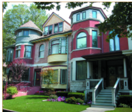
200-208 Clinton Ave.

Around 1900, as the population of the District rapidly expanded, many single-family homes were constructed in new forms using different, innovative materials. Modern styles, such as the American Foursquare and Bungalow, and popular revival styles such as Tudor, Classical and Colonial, appeared throughout the District. Although the District contains Frank Lloyd Wright's Unity