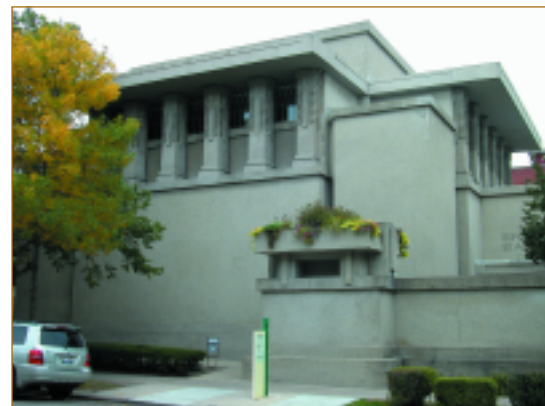
Unity Temple, 875 Lake St.

Temple, it otherwise lacks examples of Wright's mature Prairie School residential designs found in abundance in Oak Park in the Frank Lloyd Wright-Prairie School of Architecture Historic District. However, in its post-1900 houses, the Ridgeland-Oak Park Historic District does bear the unmistakable imprint of the Prairie School's more modern architectural style. During that time, many Prairie School architects, and the builders who popularized their work, began filling the area with simple, rectangular houses known as the American Foursquare, which were more symmetrical than the late Victorian homes. While a few homes were constructed of brick or wood, the more common use of light-colored stucco to cover the exterior wall surface marked a transition in building material and texture as striking as the stylistic evolution.