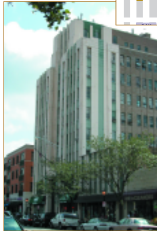
Medical Arts Building, 715 Lake St.

The significant commercial structures are located primarily in concentrated nodes, which were determined initially by their accessibility to railroad stations in the District. Built between 1890 and 1929, the major commercial buildings are constructed of brick, stone and terra cotta and are from two to four stories. They typically combine commercial/retail stores on the first floor with office and/or apartment space above. The outstanding exception to this pattern is Roy Hotchkiss' 10-story design for the Art Deco style Medical Arts Building (1929) on Lake Street, faced in white concrete and green terra cotta. The District's significant commercial structures, like the churches, present broad stylistic variety, including Prairie, Queen Anne and various revival styles.