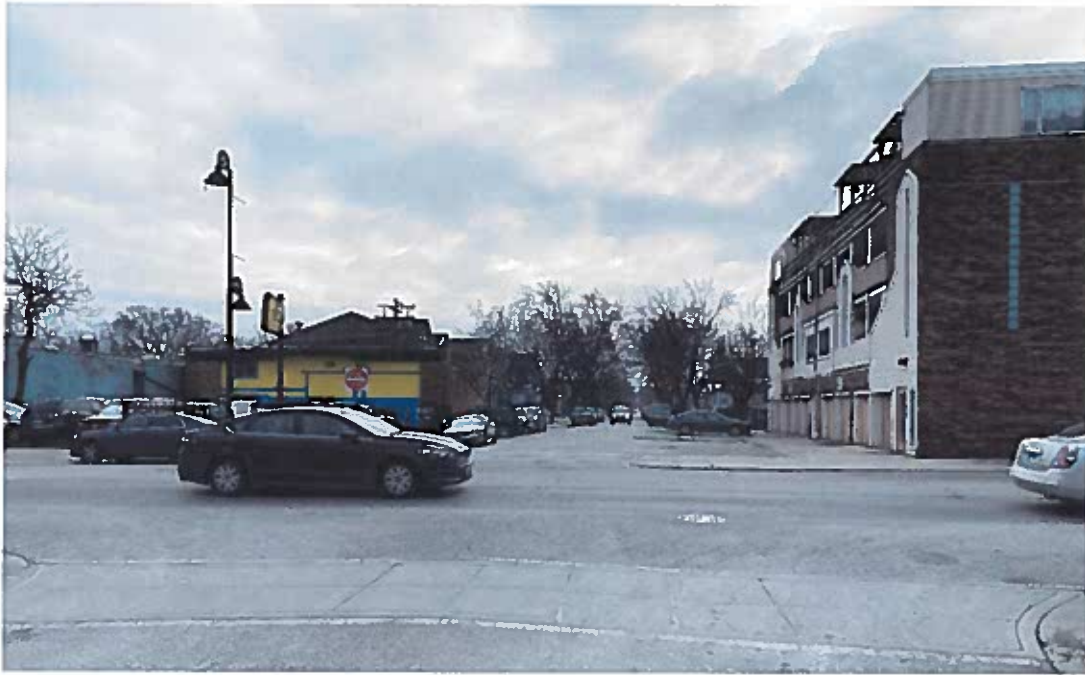
Highland Ave. on Berwyn side with a cul-de-sac and multi-unit residential buildings